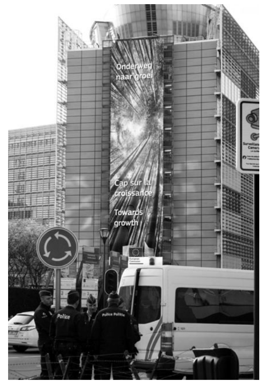
'Towards growth': the European Commission in Brussels. (Photo taken by Filka Sekulova at the Berlaymont Building, Headquarters of European Commission in Brussels, March 2014)