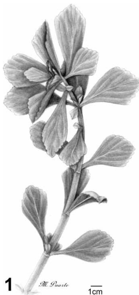
Figure 1. Plectranthus neochilus Schltr., Lamiaceae - aspect of a vegetative branch.

ab – abaxial surface of the epidermis, ad – adaxial surface of the epidermis, fv – front view, gt – glandular trichomes, ngt – non-glandular trichomes, vb – vascular bundle.